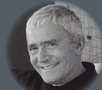
VIDAL SASSOON Worldwide Honorary Patron